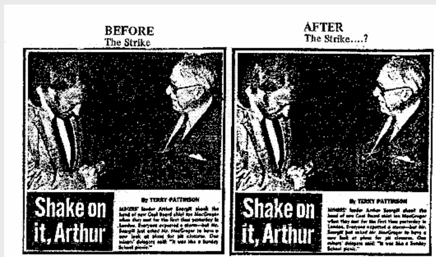
Daily Mirror, Wednesday, September 14, 1984