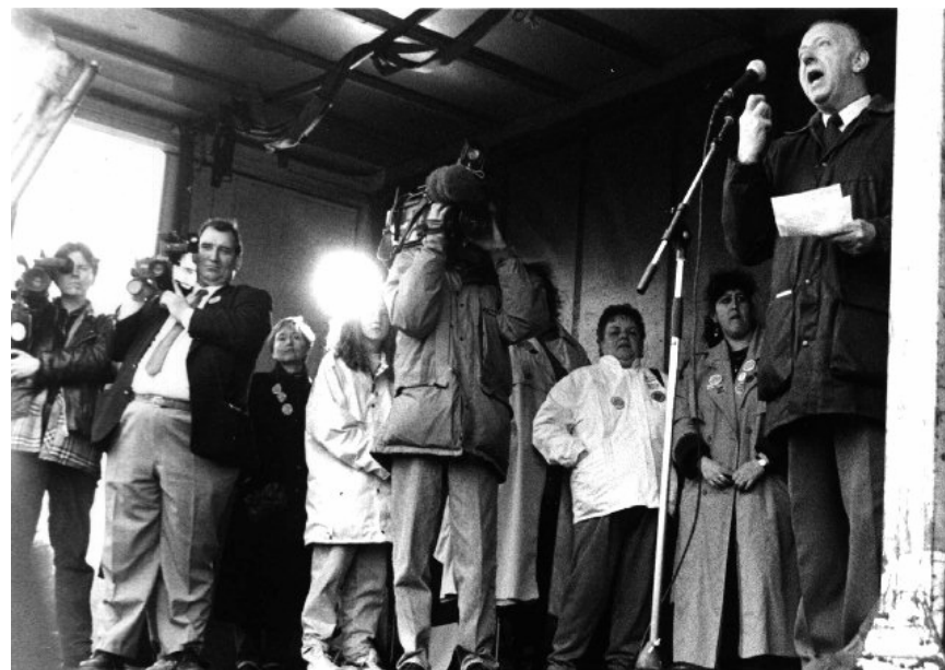
Scargill speaks, cameras roll.

because they have already sold their own voice, their anger and their desires, to bureaucrats like Scargill, who, in representing these points of view in the Courts Of The Bourgeoisie (the media and the negotiation rooms), acts as an immediately secure link with what appears to be realistic. Everywhere there are people acting for themselves in various ways, but very rarely speaking for themselves. Because hierarchical security appears everywhere as the only realistic and apparently safe path, the masses of individuals demand what seems secure according to the criteria demanded by that omnipresent God, the World Market (hallelujah!). Realism leads people to demand retirement at 55, no pit closures and £115 basic - which, even if accepted, which they won't be, are pretty minimal compensations for a wasted life. Moreover, these kinds of demands inevitably succumb to the logical implications of the contradictions of a globally competitive capital. In fact, any struggle against the graveyard of the Old World which is not to become self-defeating can only find the help and recognition of other struggles in the world by explicitly opposing the