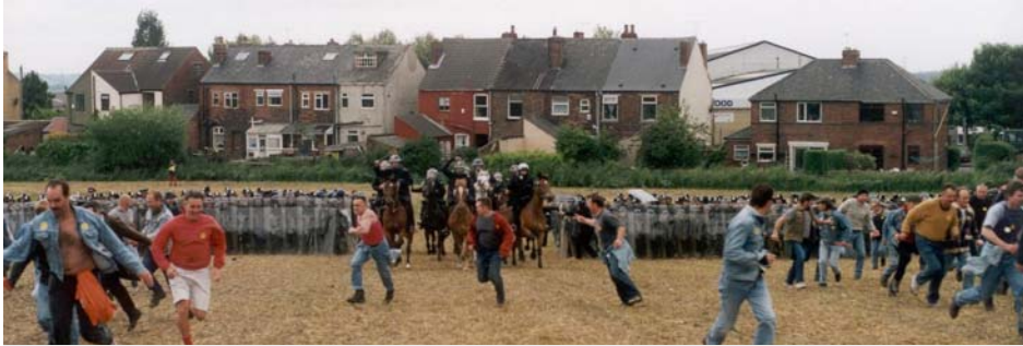
The 20th anniversary recreation of The Battle of Orgreave by the conceptual artist Jeremy Deller: "Every aspect of the reenactment was designed to be as accurate as possible, with no political 'spin.'"

human creativity to qualitatively transform the world about us, has vastly deteriorated - in many ways, because capital has been able to integrate the image of opposition, based on past defeats, into its horror show, into the development of the tedious passivity of a 'consumer' capitalism which is now decomposing faster than a vampire in daylight. Will today's proletarian struggle become yet another commodity for the consumption of future slave-spectators? Or...?