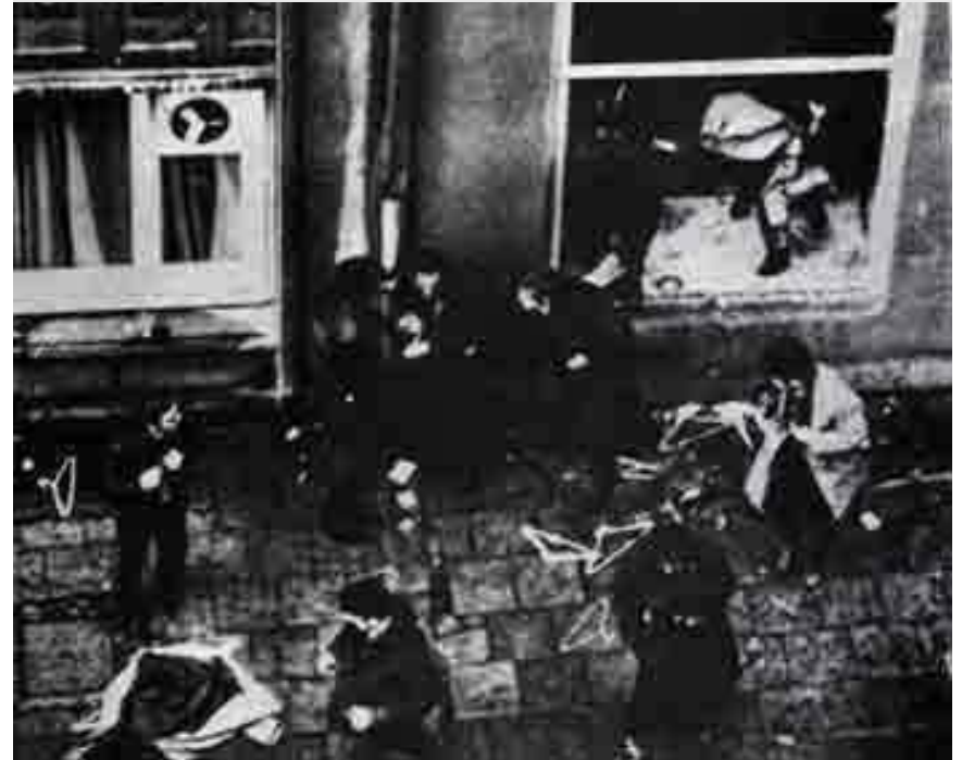
Gdansk, Poland, December 1970: Workers looting a state-owned store

Looting implies mass communal direct power, unmediated by buying and selling, by cops and specialists: it is the necessary ‘chaos’ through which we must pass in order to organise the distribution of things on a rational and playful